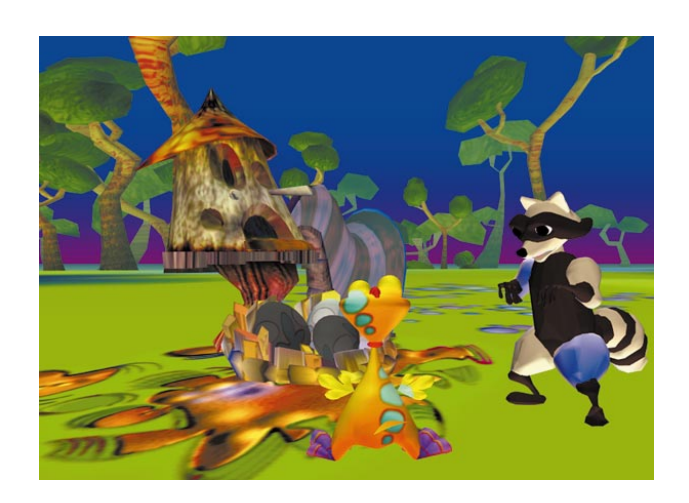
Color Plate 1: The user's view of the scene The chicken, raccoon and henhouse with eggs is visible.