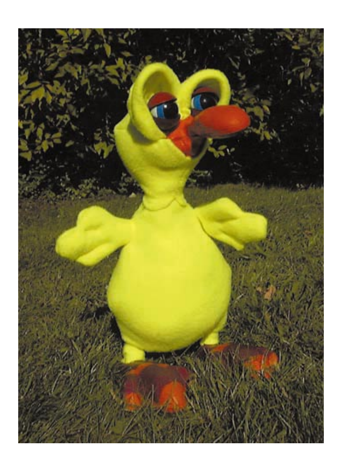
Color Plate 3: The external view of the doll