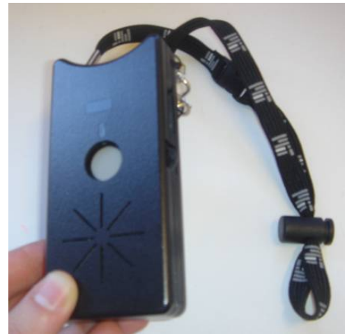
Figure 1. The sociometric badge, an example of a sensor-based system that detects individual and social behavior in real-time allowing real-time feedback.

A sensor-based feedback system for organizational computing consists of environmental and wearable sensors, computers, and software that continuously and automatically measure individual and collective patterns of behavior, identifies organizational structures, quantifies group dynamics, and provides feedback to its users. The purpose of such a system is to improve productivity, efficiency, and/or communication patterns within an organization.