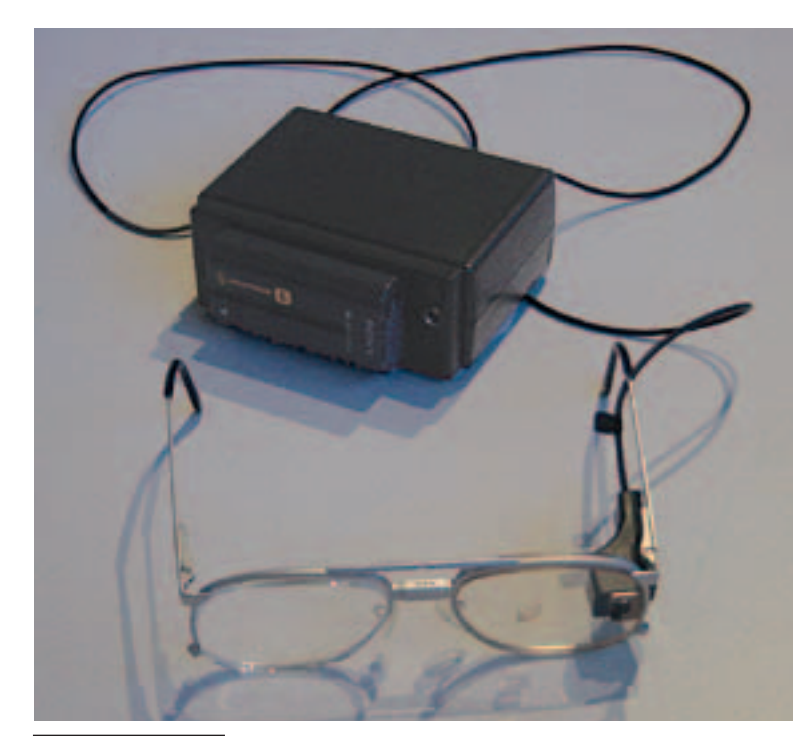
Figure 2. Memory glasses. A wearable, proactive, contextaware memory aid, the memory glasses system combines the MIThril platform with wearable sensors to provide a device that functions like a human assistant, storing reminder requests and delivering them under appropriate circumstances.

lenges ranging from complex memory loss to simple absent-mindedness. Figure 2 shows a prototype of this wearable, proactive, context-aware memory aid based on the MIThril platform and wearable sensors.<sup>10</sup>