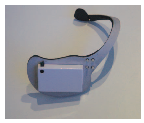
Figure 3. MIThrilbased sociometer. A biosensor hub in the badge-like device, which is worn over the shoulder, collects data about the wearer's daily interactions.

Researchers have long known that speech activ-